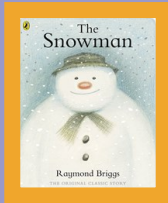
The Snowman Raymond Briggs