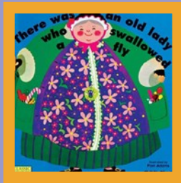
There Was an Old Lady who Swallowed a Fly