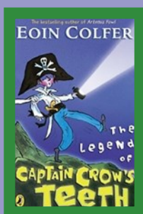
The Legend of Captain Crow's Teeth Eoin Colfer