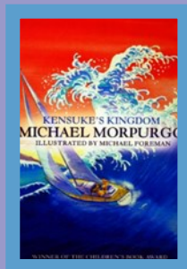
Kensuke's Kingdom Michael Morpurgo