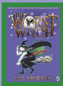
The Worst Witch Jill Murphy