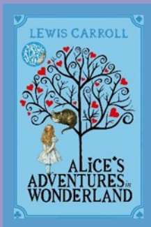
Alice's Adventures in Wonderland