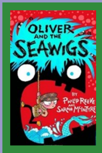
Oliver and the Seawigs Phillip Reeve