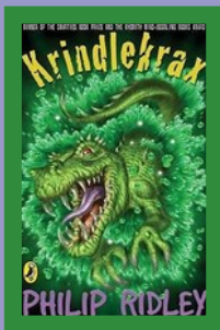
Krindlekrax Philip Ridley