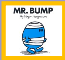
Mr Bump Roger Hargreaves