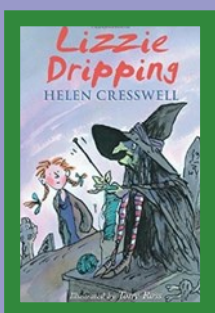
Lizzie Dripping Helen Cresswell