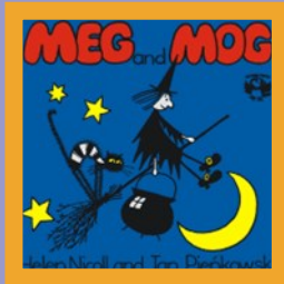
Meg and Mog Helen Nicoll and Jan Pienkowski