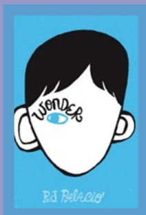
Wonder RJ Palacio