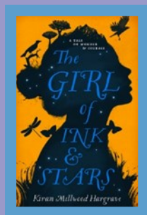
The Girl of Ink and Stars Kilan Millwood Hargraves