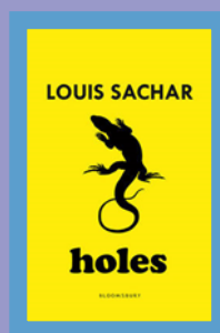
Holes Louis Sachar