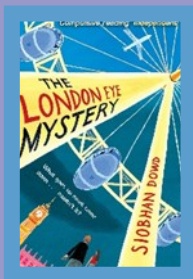
The London Eye Mystery Siobhan Dowd