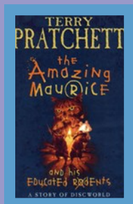
The Amazing Maurice Terry Pratchett