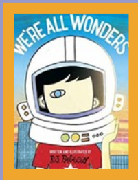
We're All Wonders RJ Palacio