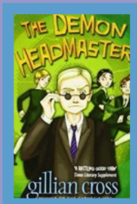
The Demon Headmaster Gillian Cross