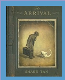
The Arrival Shaun Tan