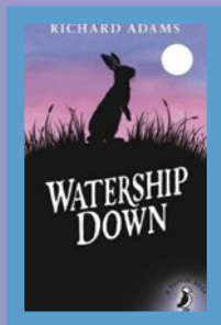
Watership Down Richard Adams