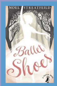
Ballet Shoes Noel Streatfeild