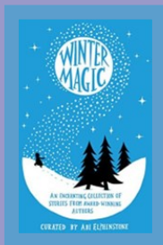
Winter Magic Stories by various authors