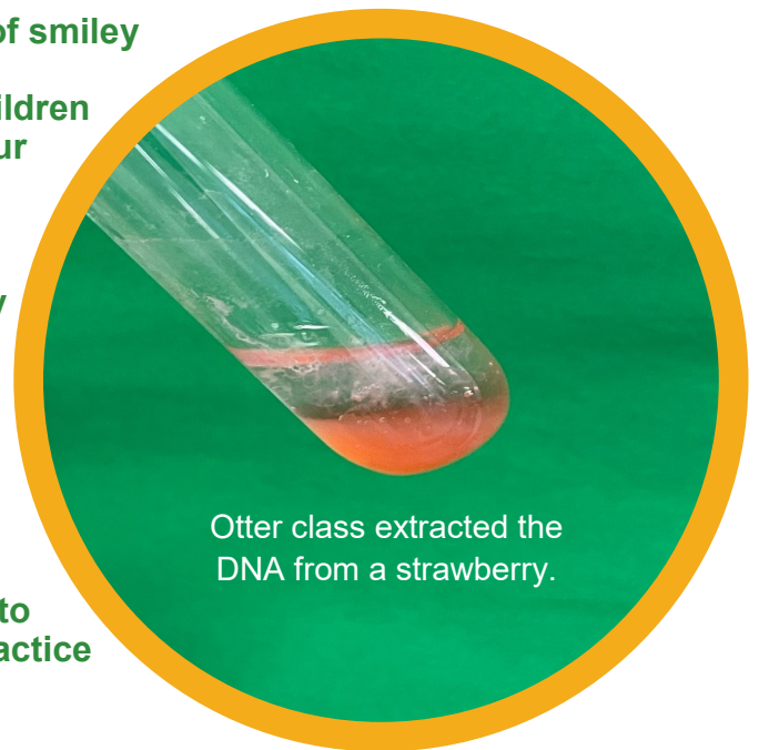
Otter class extracted the DNA from a strawberry.