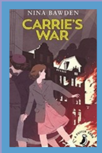
Carrie's War Nina Bawden