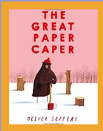
The Great Paper Caper Oliver Jeffers