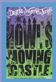
Howl's Moving Castle Diana Wynne Jones