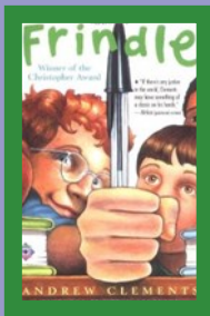
Frindle Andrew Clements