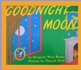
Goodnight Moon Margaret Wise Brown