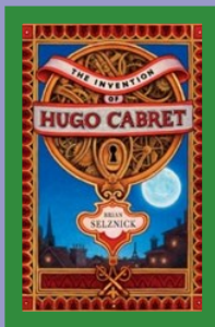
The Invention of Hugo Cabret Brian Selznick