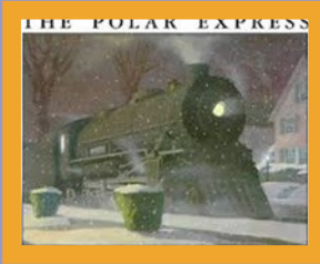
The Polar Express Chris Van Allsburg