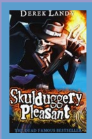
Skulduggery Pleasant Derek Landy