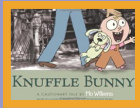
Knuffle Bunny Mo Willems