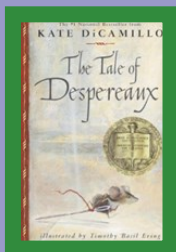
The Tale of Despereaux Kate DiCamillo