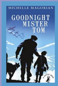
Goodnight Mister Tom Michelle Magorian