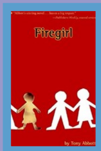
Firegirl Tony Abbott