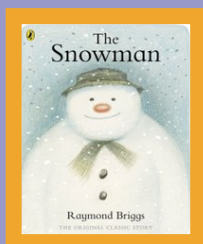
The Snowman Raymond Briggs