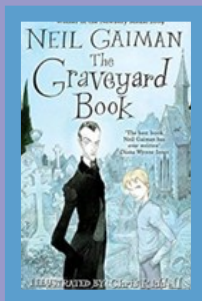
Neil Gaiman The Graveyard Book