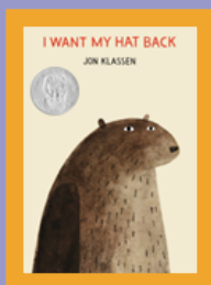
I Want My Hat Back Jon Klassen