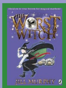
The Worst Witch Jill Murphy