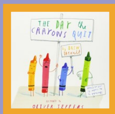
The Day the Crayons Quit Oliver Jeffers