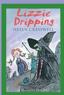
Lizzie Dripping Helen Cresswell