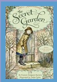
The Secret Garden Frances Hodgson Burnett