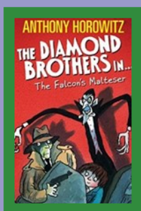
The Falcon's Malteser Anthony Horowitz