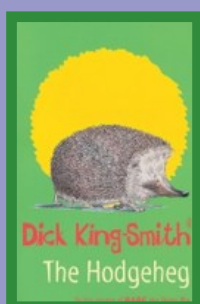
The Hodgeheg Dick King-Smith